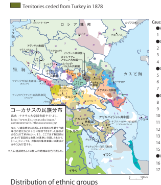
in the Caucasus region

424 000 97395 Russian territories in the Black Sea and Cas ian Sea in 1800 erritories annexed by Russia in 1801 rritories annexed by Russia be 1802-1864