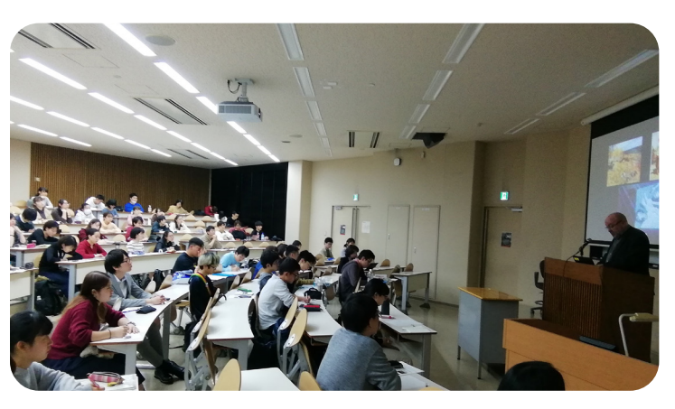
Лекция «Искусство ненависти: Насилие в советской военной культуре»

Мне приходилось и раньше бывать на различных стипендиях, но никогда все не