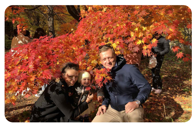
With family under autumn leaves

national autonomy in Central and Eastern Europe (1903–1926). To sure, the fellowship in Sapporo was very fruitful. I managed to take part in the conference in Tokyo, the winter symposium in Sapporo, gave a public lecture at the Center, and much more. Also, I have prepared several articles and a draft of a future book. However, in this essay I would like to tell what will remain in my memory forever.