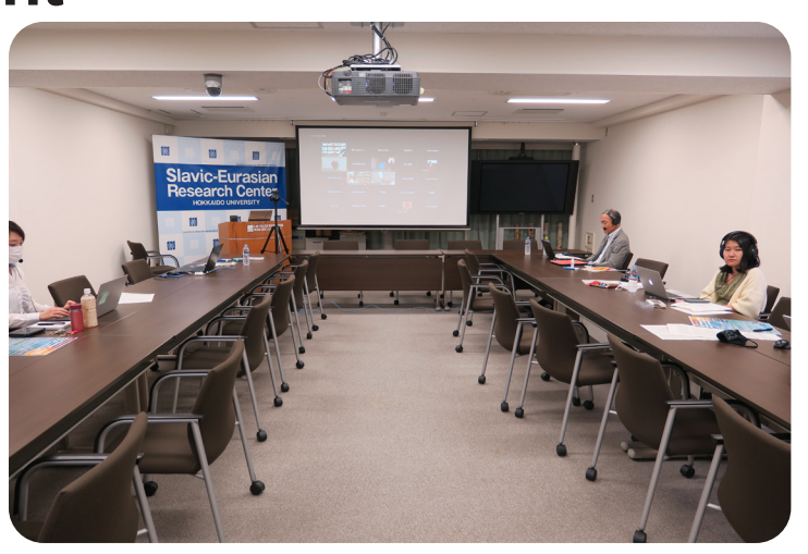
Zoom symposium outgoing

On July 2–3, 2020, the Slavic-Eurasian Research Center held its international summer symposium on "Northeast Asia: Pitfalls and Prospects, Past and Present." As a response to COVID-19, the event was held online over Zoom, rather than in person. The first half of the symposium, sessions 1 and 2, were devoted to providing a platform for researchers associated with the NIHU Area Studies Project for Northeast Asia (NoA-SRC) to discuss their findings with researchers from overseas,