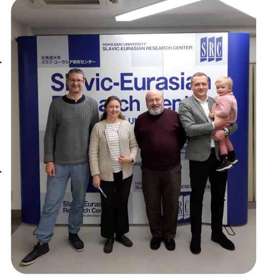
With other foreign fellows at the SRC

Sapporo has many wonderful sights. My family and I visited the local zoo, the 1972 Winter Olympics Museum, the Hokkaido Museum of History, and Museum of Contemporary Art. Since childhood, I have always been interested in the history of sports, so visiting the Olympic Museum was one of the important missions during my stay in Sapporo. I have been there several times. The magnificent "Makomanai Park" is divided into several parts: sports facilities of the competition, an