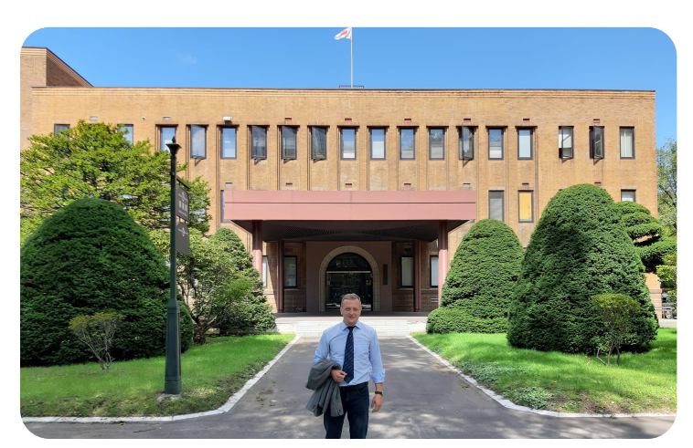
In front of the main administration building of the University

ice arena, a stadium, an interactive and informative parts. The climb to Okurayama (the former Olympic trampling for ski jumping) left a lot of impressions for life. I recall how Sapporo has also prepared for the Tokyo Olympic Games, in shopping malls one could buy symbols and souvenirs of the summer Olympics. Many people wore Olympic signs on their clothes. It is a pity that the pandemic forced the authorities to postpone this wonderful holiday of sport, peace, and beauty.