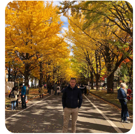
The author on the Ginkgo Avenue at Hokkaido University

In the spring of 2019, I had just finished a large tenyear project, and in a hurry, I was preparing a monograph for publication, while I was thinking about new research plans. At the same time, confidence appeared: in Sapporo I will be able to understand how to "reorient" my scholarship. To summarize, this is what happened, when I returned from Sapporo, I have been started to work on new topics about the violence during the "wars and revolutions" (1914–1923) and the entangled history of the idea of