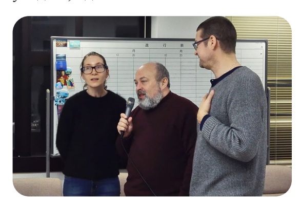
«Концерт» русской песни на праздновании Рождества и Нового года

Отдельно хотел бы сказать о сказочной японской природе. Мне довелось жить на Восточном побережье США и из природных чудес света, которые мне посчастливилось увидеть, одним из самых незабываемых была осень в Новой Англии. Мне казалось,