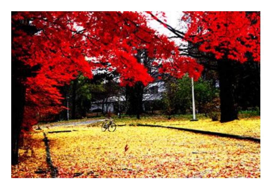
Enchanting oil painting

This adds to Hokkaido University's autumn symphony an extra, venerable movement.