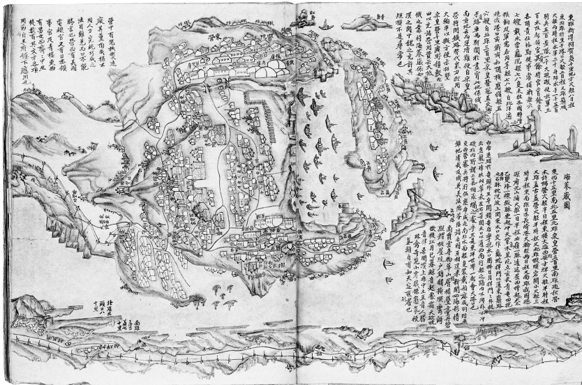
Figure 3: Vladivostok-city in Aguk-yeojido [Map of Russia] (Seongnam: Jangseogak Library, Academy of Korean Studies, 2007:14-15)

Vladivostok, which in 1880 was given a city status equal to that of Kronstadt, is also drawn and described in a detailed and picturesque way. The description of the city landscape and its positioning are done in the form of allegory, in accordance with Fengshui , the Taoist practice of design and arrangement. The Yin and Yang (male and female essence) characteristics, the concept of five elements (fire, metal, earth, wood, water) and other images of traditional Oriental cosmogony are involved, and designed to determine whether a person’s surroundings are in harmony or not. Cardinal directions’ alignment is done with the use of traditional imagery: the Black Army of Xuan Wu and mythical creatures in the form of a serpent and a turtle are mentioned to point out the north, and a