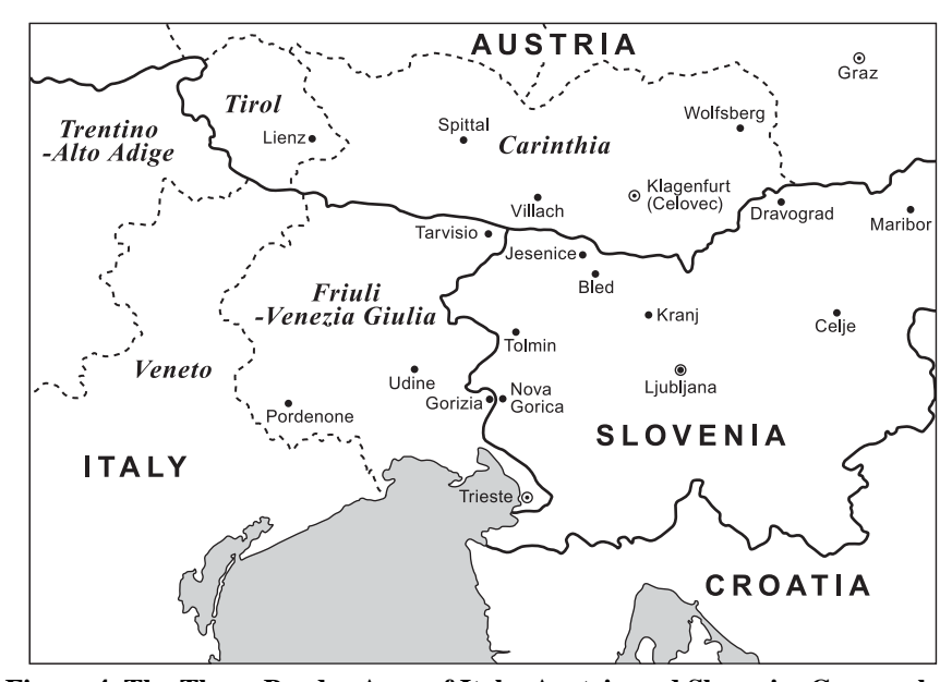
Figure 4 The Three-Border Area of Italy, Austria and Slovenia: Geography

negatively affected by the IEBL, because improvement of roads, train schedules and maintenance has to be negotiated and planned well in advance.