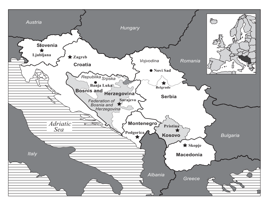
Figure 1 Nation-States on the Territory of Former Yugoslavia, 2008