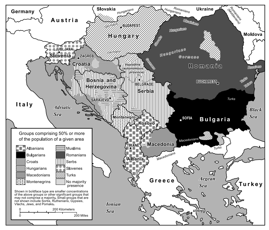
Figure 2 The Ethnic Puzzle in the Balkans

member candidates of the Western Balkans: Serbia, Macedonia and Montenegro. Croatia had this status since 2004. In 2010 the visa requirements were additionally lifted for residents of Bosnia and Herzegovina and Albania. The only remaining nation-state not enjoying this EU-privilege is the Republic of Kosovo. In addition to threats of further disintegration of existing nation-states, in particular within Bosnia and Herzegovina (the case of the autonomy of the Republika Srpska), bilateral disputes remain the biggest obstacle for a peaceful regional co-operation after the violent disintegration of Yugoslavia 20 years ago. Among bilateral disputes, disagreements on nation-state border delineation are most serious.