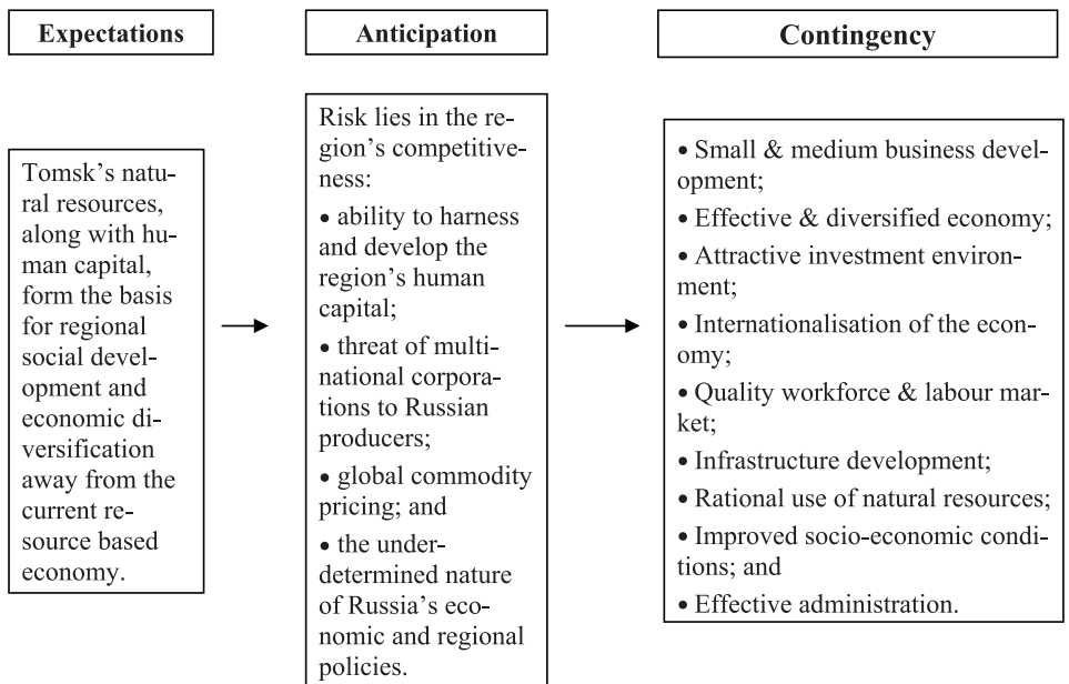
Figure 2 Tomsk Oblast's Socio-economic Development Strategy

It is of particular interest to the current argument the observed vulnerability of the region's energy sector both federal interests and the commodity prices set at the global level. As stated ear-