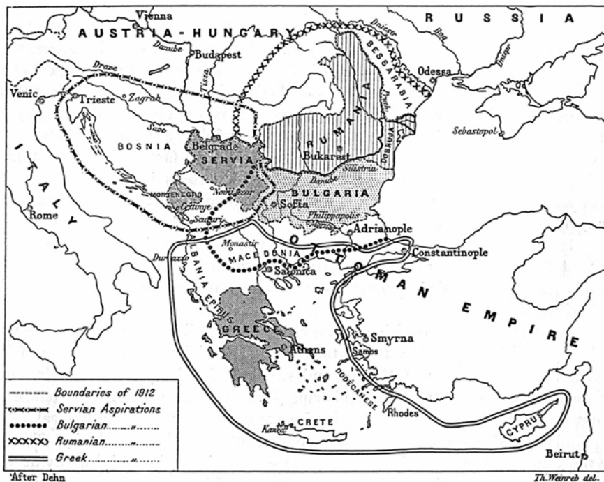
2 After Dehn Competing Balkan Nationalisms 2