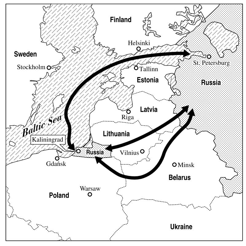
Access to Kaliningrad

of trilateral accession talks have been substituted for a more creative and businesslike approach. Its core is, instead of a formal involvement in trilateral negotiation formats, the implementation of trilateral EU-CE-Russia economic projects. The idea is to avoid presenting the EU and Russia as two opposing poles, but rather as "complementary parts of the European economic unity." In the institutional domain, Russia also succeeded in establishing a well-structured relationship with a permanent body for managing relations with the EU that resembles somewhat the NATO-Russia Council