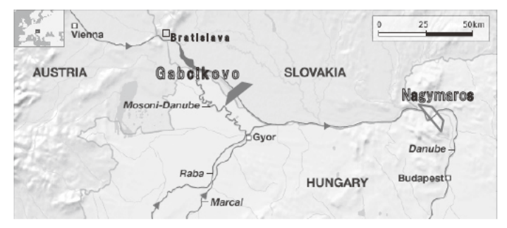
The Danube between Slovakia and Hungary