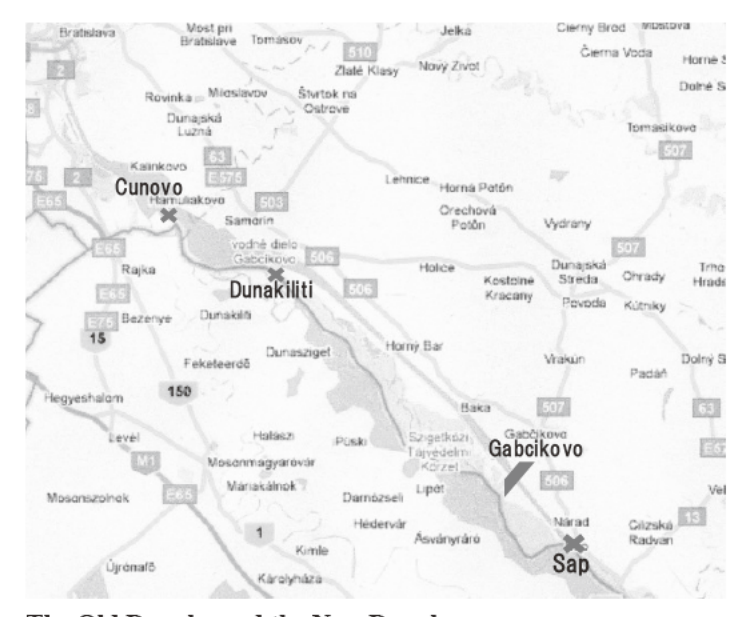
The Old Danube and the New Danube