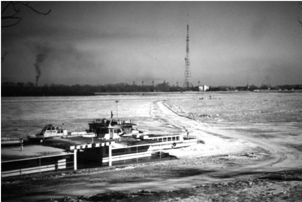
Heihe and Blagoveshchensk (opposite bank) (Feb., 1994)