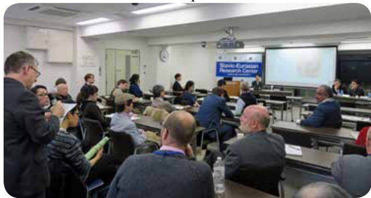
A scene from one of the sessions

East Asia still seems to be living in the long shadow of the “short twentieth century.” Or, indeed, the “short twentieth century” does not even seem to have passed here. In his book The Age of Extremes , Eric Hobsbawm defines his “short twentieth century” as the years from the outbreak of the First World War to the collapse of the Soviet Union. He recognizes the lasting impacts of the October Revolution on this whole era. In contrast, we framed our annual winter symposium by “the long twentieth century” so as to elaborate and expand historical inquiries beyond the Cold War thinking (or obsession that continues to shape our twenty-first century).