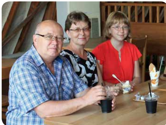
The author and his family enjoying life in Sapporo

изданиях была ограничена в силу жесткой конкуренции, особенно для аспирантов. Любая попытка опубликовать в провинции какой-либо материал, касающийся зарубежных стран требовала обязательного согласования с соответствующим подразделением Министерства иностранных дел. Что касается источников, то, как выше уже было сказано, они были сосредоточены исключительно в столичных библиотеках. Все это сдерживало творческий рост провинциальных исследователей проблем всеобщей истории, затягивало сроки подготовки ими диссертаций.