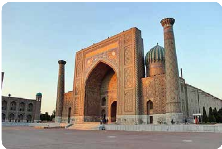
A medieval university—madrasa in Samarkand

Центр славянско-евразийских исследований при Университете Хоккайдо является прекрасной площадкой для встреч и обсуждений различных проблем истории и современности с коллегами из разных стран, включая Китай, Россию, Казахстан, Кыргызскую Республику и т. д.