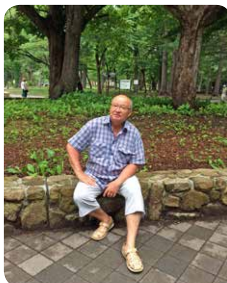
The author at Maruyama Park, Sapporo

Весной 2017 г. мне посчастливилось оказаться среди тех, кто был избран Центром славяно-евразийских исследований университета Хоккайдо для долговременной научной командировки в Японию. Целых 10 месяцев спокойной кабинетно-библиотечной жизни, возможность завершить множество когда-то начатых и по разным причинам заброшенных текстов, всерьез, а не на бегу углубиться в написание давно задуманного текста о судьбах японских дипломатов в России. Об этом можно было только мечтать! 1 июня я уже летел в Саппоро. Я люблю приезжать в Японию весной или в начале лета — кажется, что с ожившей природой и у тебя начинается новый период жизни и все самое интересное и важное еще впереди.