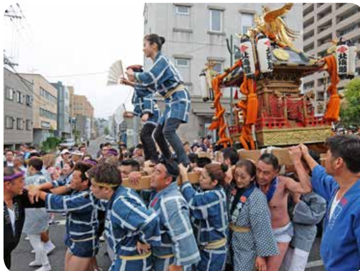
Otaru Summer Festival, July 2017

shops make it a very attractive destination. I have been there four times but still cannot claim I have seen everything in Otaru I wished to experience. In addition, all tourist signs in Otaru are equipped with information in Russian, a very welcoming service for any Russian who would like to pay a visit to this pleasant town situated at the Sea of Japan. Hokkaido is famous for its beautiful natural parks available to visit as a part of convenient bus excursions from Sapporo. Neither is the legacy of traditional Ainu culture to be missed, by paying visits to Ainu villages and a number of interesting museums. One of such museums is actually located within the Hokkaido University Botanical Garden.