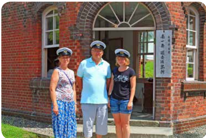
In front of the building of an old police station in the Historical Village of Hokkaido

японцев сохраняется в истории как неосознанный феномен и продолжает беспокоить и современное поколение. Вероятно, эта трагическая часть истории двусторонних отношений окончательно уйдет в прошлое только когда в ней не останется незаполненных страниц.