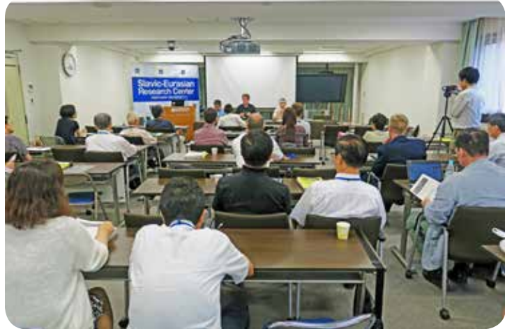
A scene from the last session (discussion)