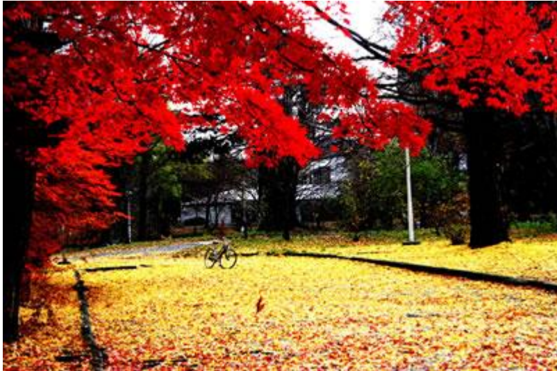
Enchanting oil painting

This adds to Hokkaido University's autumn symphony an extra, venerable movement.