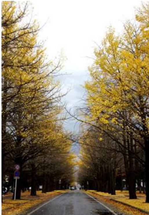
Ginkgo Road: Take me to Hokkaido University

The Slavic Research Center is located in the corner of Hokkaido University. It is its epitome, the essence of its quiet peacefulness, yet also reflecting its vigor and glory. Here, the library is an ocean of knowledge; the academic conference, the platform for exchange of ideas.