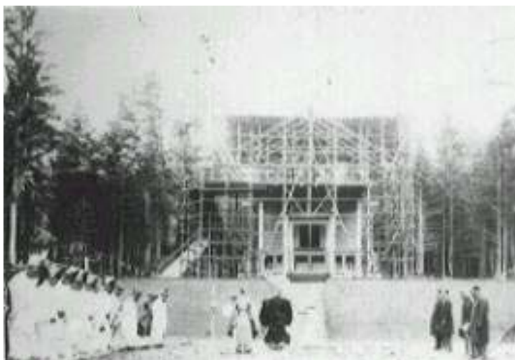
Fig. 9. The Karafuto-Jinja (1911)

tion. 31 Therefore, his preferment indicated how excellent he was recognized.