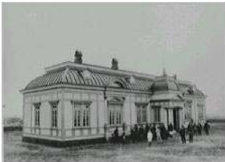
Fig. 6. The Toyohara Country Courthouse (a. 1908)