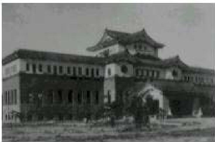
Fig. 14. The Karafuto-Cho Museum (1937)

Among these, the Normal School at Kamakura deserves to be noted for comparison with the Karafuto-Cho Museum (Fig. 14). In addition to these projects, possibly he worked on the Kanagawa Prefectural Government Office project, considering that he was the person designated to conduct the completion ceremony. It is well