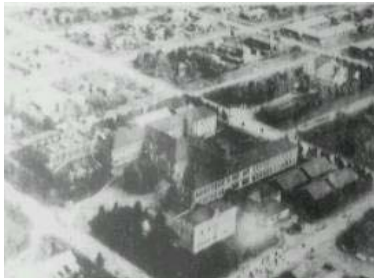
Fig. 5. The Karafuto-Cho Office Building (a. 1908)

This was a two-story stick style building. It was probably built by August 1908, because the Karafuto-Cho had moved to Toyohara on August 23, 1908. It was built according to an H-shaped plan and had a steep hipped roof with half-round dormer windows. The Karafuto-Cho building was rebuilt and extended almost every year, and was used until the 1940s. A new build-