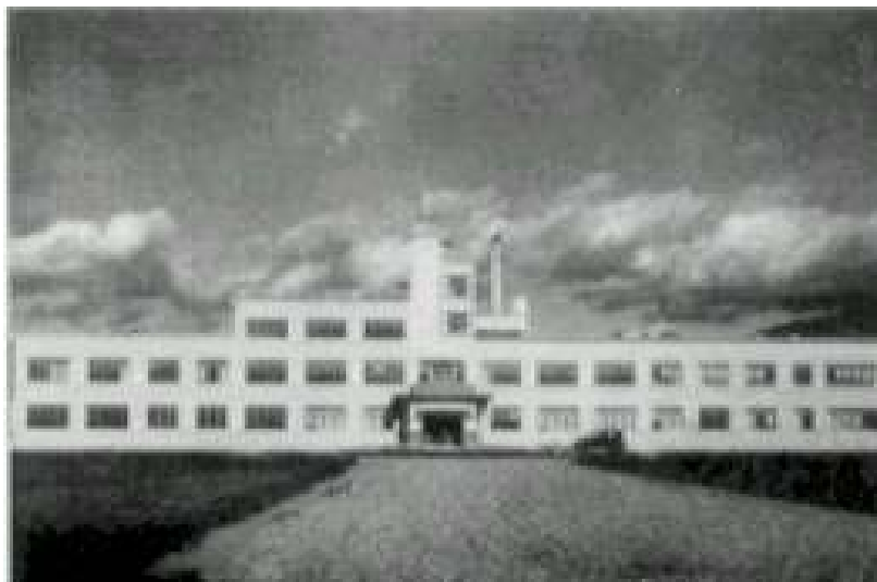
Fig. 12. The Central Industrial Laboratory

Karafuto-Cho had 289 officials in 1907, but the number increased drastically to 2,537 in 1936 (including workers in branch offices). 42 It can be assumed that other offices were also experiencing similar circumstances. Nevertheless, in spite of several rebuilding plans, the new building for the Karafuto-Cho could not be built until 1945 because of budget deficits.