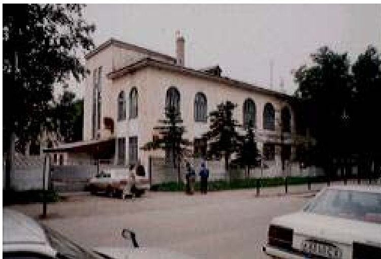
Fig. 15. The Karafuto-Cho Annex Building (1934)

This building was two-storied, made of reinforced concrete and had a heavy Spanish influence, which was prevalent among residential designs. The annex was designed to function as a convention house and had a large convention room on the first floor, an office on the ground floor and a cafeteria and a boiler room on the basement.