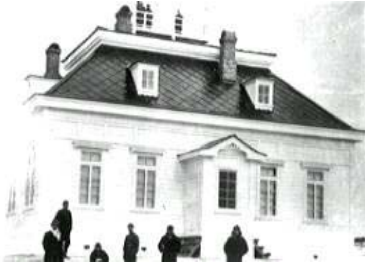
Fig. 4. The Meteorological Observatory of the Karafuto Guards (1907)