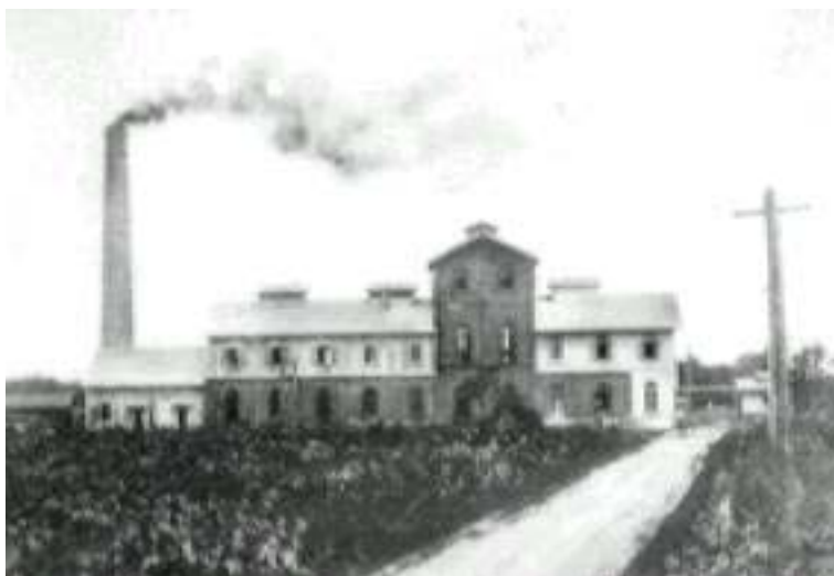
Fig. 10. The Distillery of Toyohara (1911)

The contemporaries looked to the "Karafuto Jinja" as a new symbol of colonized Sakhalin. Karafuto Nichinichi Shimbun [Karafuto Daily News] made detailed reports on construction progress up to the completion date. According to Kita Nihon Shimbun [Northern Japan Newspaper], of August 23, 1911, although the construction section of the Karafuto-Cho had completed to design this shrine by about the summer of 1942, the design was suddenly changed to another design by a famous architect Chuta Ito (1867-1954), follow-