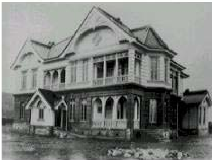
Fig. 2. The Official residence for the Commander of the Karafuto-Guards (1908)

plan of suitable building styles; 2) heating methods for barracks and offices; 3) winter lighting methods; 4) methods of supplying water; 5) variety, price and availability of wooden building materials; and 6) appropriate wooden building materials and methods of supplying them. 16