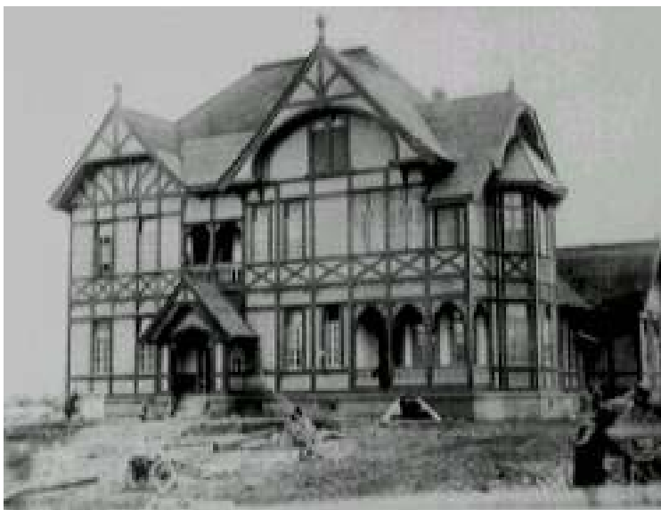
Fig. 3. The Official Residence of the Governor General of the Karafuto-Cho (a. 1908)

Numerous clapboard buildings with decorative wooden pillars, beams and other ornamental features were built as administrative buildings in those days. That architectural style is called “stick style.” The Karafuto-Cho building and headquarters of the Karafuto Guards are notable examples. Such stick style buildings were surely connected with architect Tamura for he was the only architect, as we have seen, who was concerned with all these buildings as chief designer. We suppose that Yasushi Tamura might have