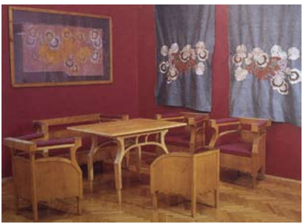
Illust. 18. Stanisław Wyspiański, living room of Zofia the meantime, another magand Tadeusz Żeleński reconstructed in Wyspiański nificent handcrafted wedding Museum, Cracow

There is a continuity of approaches between the Bride's Room in Lviv and the Żeleńskis' apartment in Cracow (Illust. 18), as both were furnished with hand-