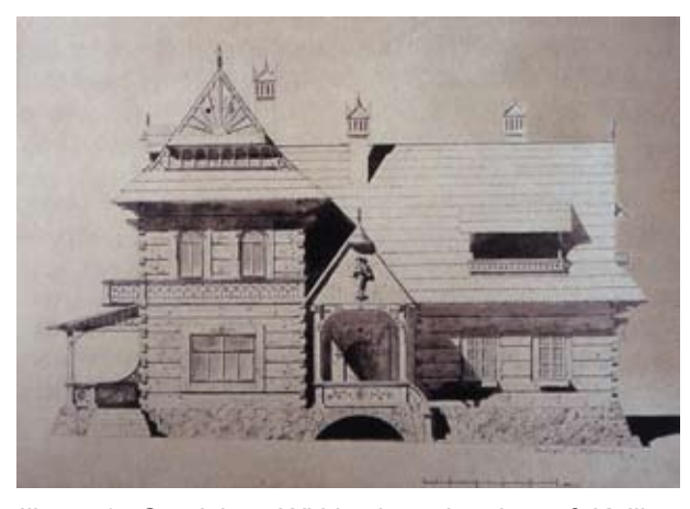
Illust. 1. Stanisław Witkiewicz, drawing of Koliba, 1892

This paper sets out to put some hitherto separate threads in the history of Polish crafts around 1900 together, and it is a first attempt to highlight the bearing of the early collections of historical handicrafts in manor museums on the zeal for collecting ethnographic objects, which resulted in the subsequent creation of styl swojski in interior furnishings and architecture. Passionate interest in history and serious historical studies also underpinned