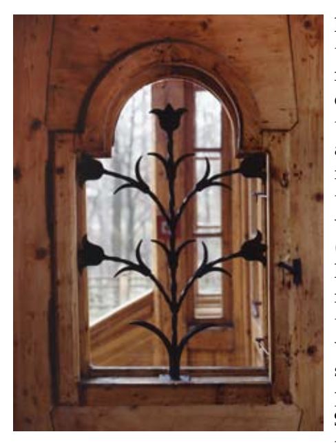
Illust. 6. Stanisław Witkiewicz, stylized in engraved silver was malily in the window, Koliba (photo courtesy jeweler, Wojciechowski. 44 of the Tatra Museum in Zakopane) Witkiewicz's rich kr

himself was responsible for the design of the decorative motifs and most of the furnishings, including the curtains with an embroidered pattern derived from woolen trousers worn by highlanders, the doors and windows, with characteristic joints in the framing and a motif of sun rays, the iron gratings in the windows, and the wood carvings with stylized lily flowers (Illust. 6). In the Arts and Crafts manner, he designed some minutiae of the decoration, such as the ornamental hinges of the shelves or a coffee set, whose handles were modeled on wooden ladles used by shepherds (Illust. 7). The set was made of porcelain in Sevres and was known as "Le Style Polonaise," and another version of it in engraved silver was made by a Cracow