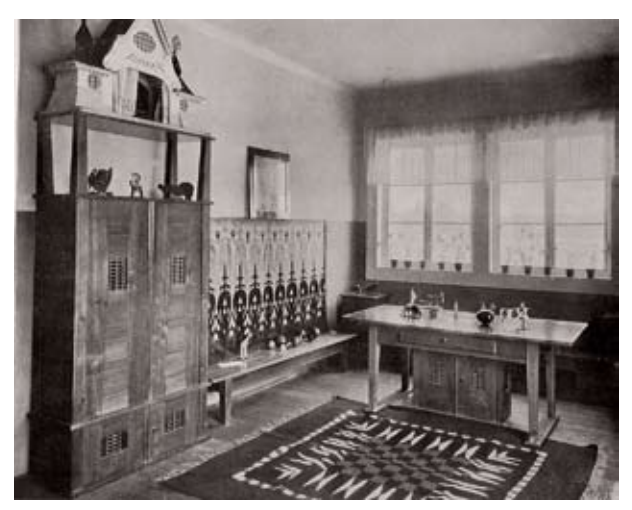
Illust. 21. Edward Bartłomiejczyk, children's room in the Exhibition of Architecture and Interiors in Garden Settings, Cracow 1912

to the new ideals of modernity with its claims to space and light. The revival of crafts had by then become an assimilated experience and the rooms, designed by individual artists, were furnished with pieces of often simplified design and made generous use of handwoven kilims and carpets, hanging on the walls and lining the floors (Illust. 21). Though evocative of the homes of the Polish gentry and nobility of the past, whose walls were richly lined with hangings, the modern design of the textiles in the Cracow exhibition, no less