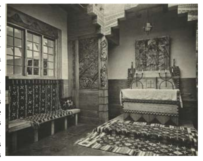
in the Zakopane style. Witkiewicz himself launched a Sczepkowski's woodcarvings and Wanda Kossecka's kilims (photograph from the exhibition in Paris, 1925)

Identified as quintessentially swojski, the Zakopane style was gaining momentum and popularity among more progressively minded Poles and it soon became successfully promoted outside the Tatras. Costumes decorated with highlander motifs or pieces of furniture and textiles were displayed with great success during the exhibitions, and an outlet in Warsaw was opened for the sale of clothes kiewicz himself launched a campaign for the introduc-