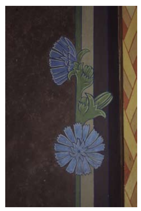
Illust. 19. Stanisław Wyspiański, detail of a wall painting with a chicory flower in the chancel of the Franciscan Church in Cracow, 1897–1904