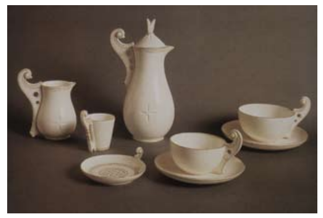
In 1891, because of advances Illust. 7. Stanisław Witkiewicz, tea set (photo couring the treatment of tuberculor tesy of the Tatra Museum in Zakopane)

na Podhalu (Decorations and domestic utensils of Polish people in Podhale), published respectively in 1892<sup>45</sup> and 1901 (Illust. 8). Matlakowski (1850–1895) was a distinguished surgeon from Warsaw, who modernized Warsaw hospital wards and introduced Joseph Lister's antiseptic method into hospital practice, and was very well-read and traveled. 46 In 1891, because of advances in the treatment of tuberculo-