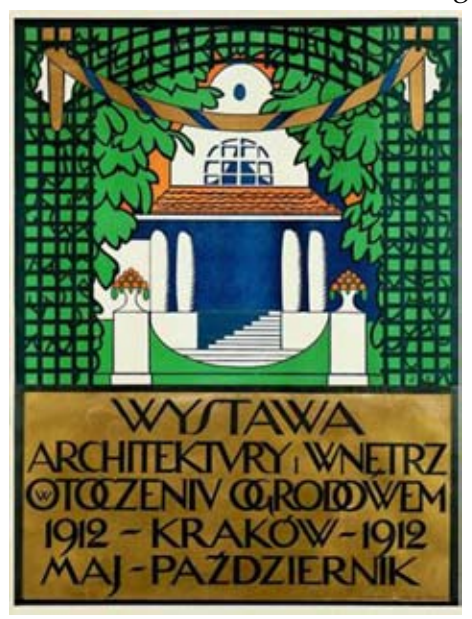
Illust. 2. Poster advertising the Exhibition of Architecture and Interiors in Garden Settings, organized by the Polish Applied Arts Society in Cracow in 1912

the work of Stanisław Wyspiański, one of the most outstanding representatives of Polish modernism and a moving force behind the foundations of the Polish