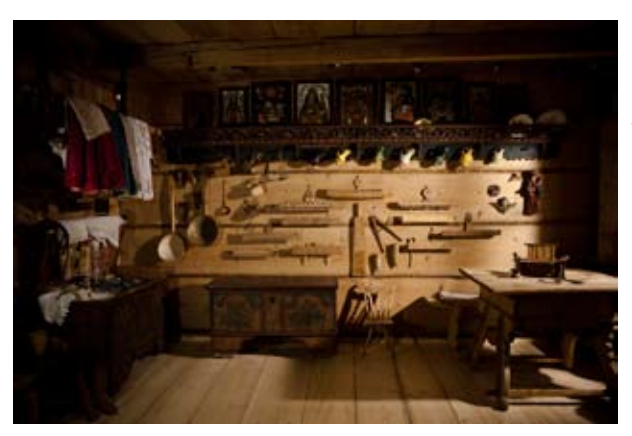
Illust. 3. Dembowski's ethnographic collection reconstructed in the Gąsienica-Sobczak Museum in Zakopane