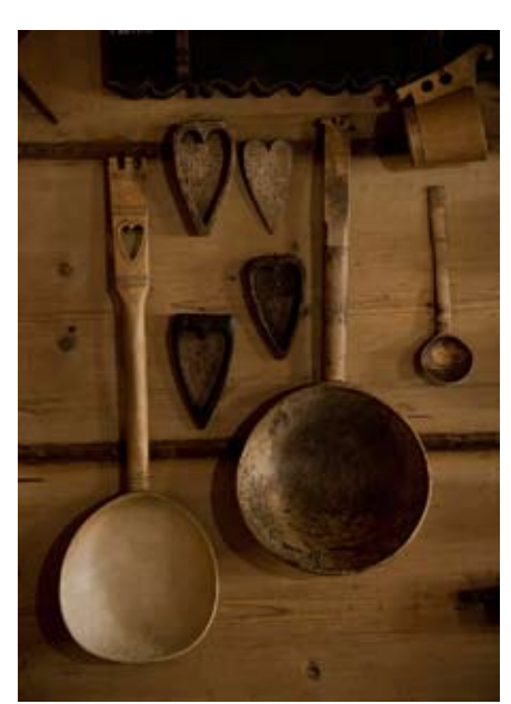
Illust. 4. A set of old wooden spoons, same collection as Illust. 3

the first collections of highlanders' costumes and domestic objects, such as intricately carved wooden spoon holders, cheese moulds, pieces of embroidered clothing, and metalwork broochfrequently saving from destruction unique eighteenthcentury items (Illust. 3 and 4). In Lviv, Dembowski's collection was on loan in the ethnographic section.38 The collection was also meant to provide models for domestic crafts and Dembowska herself designed a hanging inspired by broad forms of folk