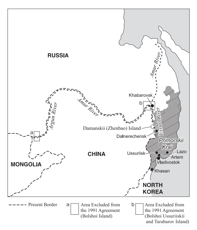
Figure 1: Sino-Russian Eastern Border

the scale of cross-border migration in the area on Russia-China relations, on ethnic stereotypes of Chinese migrants, and on preferences toward Chinese policy migration among the Russian border province population. The study draws on the Russian census data aggregated by county, city and town (1989, 2002), migration data from the Primorskii Krai statistical service, and on the original opinion surveys directed by the author and carried out by the Public Opinion Research Laboratory of the Institute for History, Anthropology, and Ethnography of the Peoples of the Far East in 2000 (N=1,010) and 2005 (N=600). The Institute research team interviewed 387 respondents in both years, sampled from all the counties where the first survey was taken. This subsample enabled us to