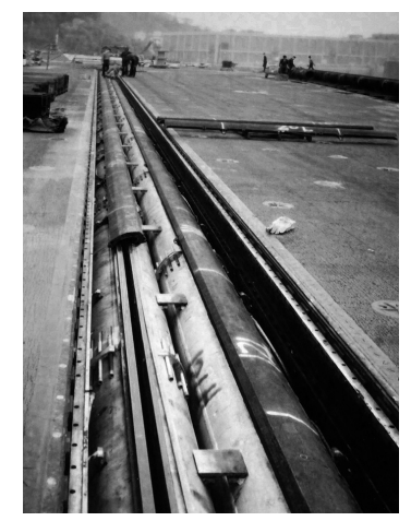
Figure 8: Steam Catapults of the USS Independence (Koichi Sato)

No one has confirmed whether the PLA Navy has the technology to develop steam catapults or not. But we should keep in mind the fact that even the technologically advanced French Navy imported U.S. steam catapults for the