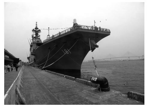
Figure 7: JMSDF's Helicopter - escort ship, Hyuga (Koichi Sato)

China imported foreign aircraft carriers for research purposes, namely the Melbourne (displacement 14,224 tons) from Australia in 1985, the Minsk (displacement 42,000 tons) and the Kiev (displacement 42,000 tons) from Russia in 2000, and