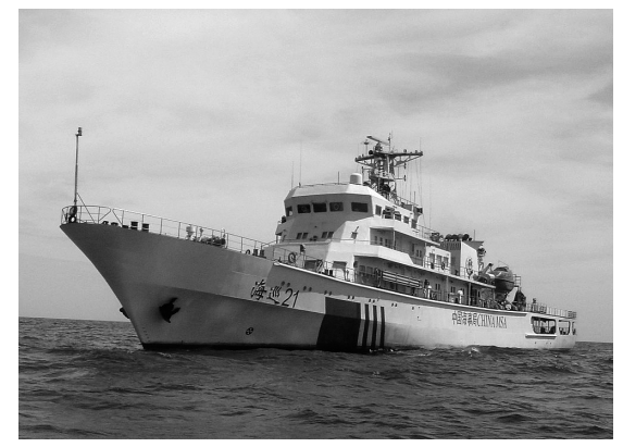
Figure 4: A Patrol Vessel of the Chinese Ministry of Transport

One Chinese senior official also claimed the South China Sea as their core interest to U.S. Secretary of State Hillary Clinton at the Strategic and Economic Dialogue in May 2010, <sup>46</sup> and a big patrol vessel belonging to the Chinese Ministry of Agriculture confronted small Indonesian Navy patrol boats in the sea area of the