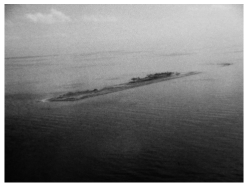
Figure 1: Artificial Island of Swallow Reef (Koich Sato)

Before World War II, the ROC, the French Colony of Indochina, and Japan competed for sovereignty over the Spratly Islands, and the Imperial Japanese government incorporated the Spratly Islands into Japan's territory as a part of Taiwan, and called them the Shinnan Islands in 1938. 10 Japan was forced to renounce all its foreign territories after World War II. The ROC declared that all the islands were a part of Chinese territory in 1947, and stationed troops in Itu Aba Island. 11