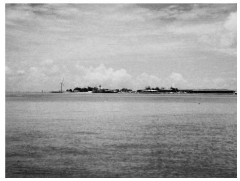
Figure 3: Artificial Island of Swallow Reef (Koich Sato)

changed. They preferred bilateral negotiations and have tried to avoid conference diplomacy. The Chinese Ambassador to ASEAN said that "ASEAN never utilized its own conflict solution mechanism, the High Council in Treaty of Amity and Cooperation in Southeast Asia (TAC), for internal ASEAN disputes, and has always negotiated issues bilaterally. Given this, we should adopt bilateral negotiations for the Spratly issues, too. It is unfair that ASEAN leaders insist on multilateral