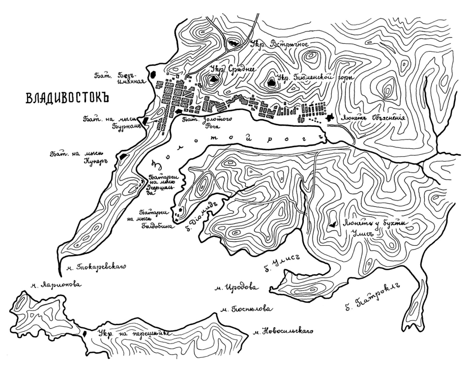
Figure 4: Vladivostok fortifications in the second half of the nineteenth century, Ayushin et al., Vladivostokskaia krepost [Vladivostok Fortress] (Vladivostok: Dalnauka, 2006). (Thank you to Dr. Vladimir Kalinin for his kind permission to reproduce this map.)

with its food supplies storehouses, military plant, hospital and arsenal is shown on the map.