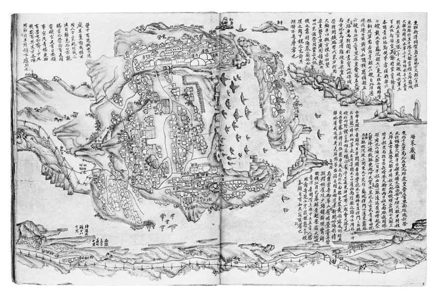
Figure 3: Vladivostok-city in Aguk-yeojido [Map of Russia] (Seongnam: Jangseogak Library, Academy of Korean Studies, 2007:14-15)

Vladivostok, which in 1880 was given a city status equal to that of Kronstadt, is also drawn and described in a detailed and picturesque way. The description of the city landscape and its positioning are done in the form of allegory, in accordance with Fengshui , the Taoist practice of design and arrangement. The Yin and Yang (male and female essence) characteristics, the concept of five elements (fire, metal, earth, wood, water) and other images of traditional Oriental cosmogony are involved, and designed to determine whether a person's surroundings are in harmony or not. Cardinal directions' alignment is done with the use of traditional imagery: the Black Army of Xuan Wu and mythical creatures in the form of a serpent and a turtle are mentioned to point out the north, and a