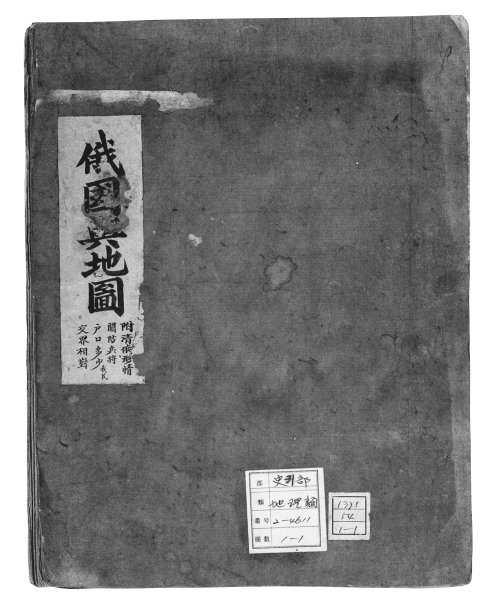
Figure1: Title-page of Aguk-yeojido [Map of Russia] (Seongnam: Jangseogak Library, Academy of Korean Studies, 2007)

The source document, the "Map of Russia," is kept in the History and Geography section of Jangseogak Library (stock number 2-4611) of the Academy of Korean Studies (Seongnam, Republic of Korea). When folded it becomes an album. Ten leafs of the map, folded in half, and two leafs containing the table of contents and the notes,