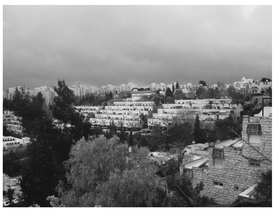
Figure 2: A general view of the French Hill neighbourhood

In more details, both geographically and symbolically the frontier location of French Hill is significant. Geographically it is surrounded by a "contested landscape" including a fraction of the Separation Wall. It watches (and indeed is watched by) the Palestinian refugee camp of Shuaafat and it marks the edge of the city as it is situated by the main road that leads to and from the Judean desert.