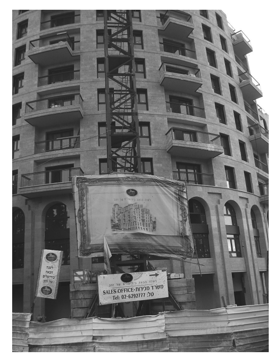
Figure 3: "Jerusalem of Gold" Housing Compound

The most significant message to potential buyers is no doubt the religious and national centrality of Jerusalem. Thus several large images of "historical Jerusalem" are presented. The first instance is an image of archaeological