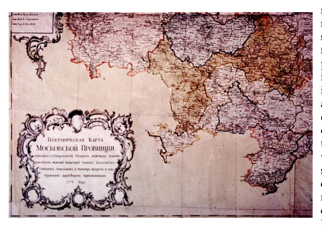
Figure 29. Map of Moscow Province (1774)

names would not be obscene."34 Aside from the Soviet period, which is not covered in this chapter and famous for drastic changes of place names, the other major wave in Russian history to change place names was caused by the Imperial government decree