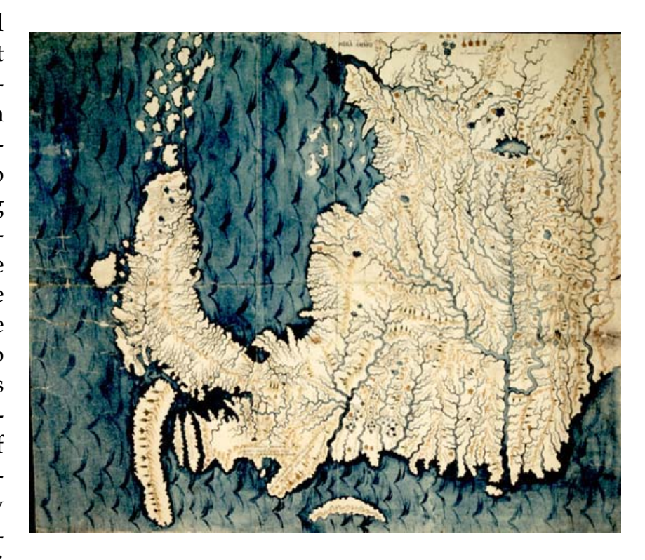
Figure 30. Map of Eastern Siberia from the Lena to Kamchatka Inclusive